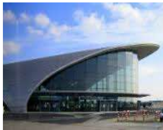
Valencia's International Airport