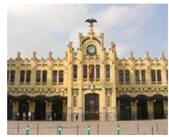
Valencia's Rail Network