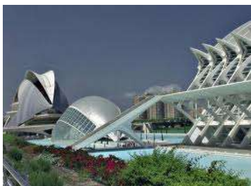
Valencia's Arts & Science City